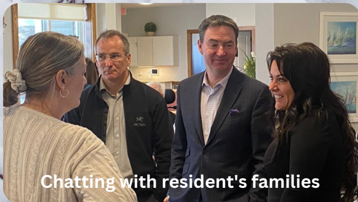
Chatting with resident's families