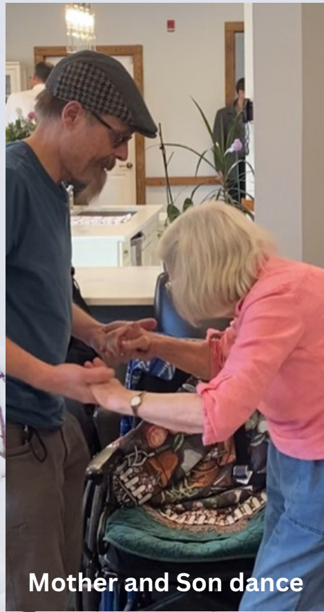
Mother and Son dance